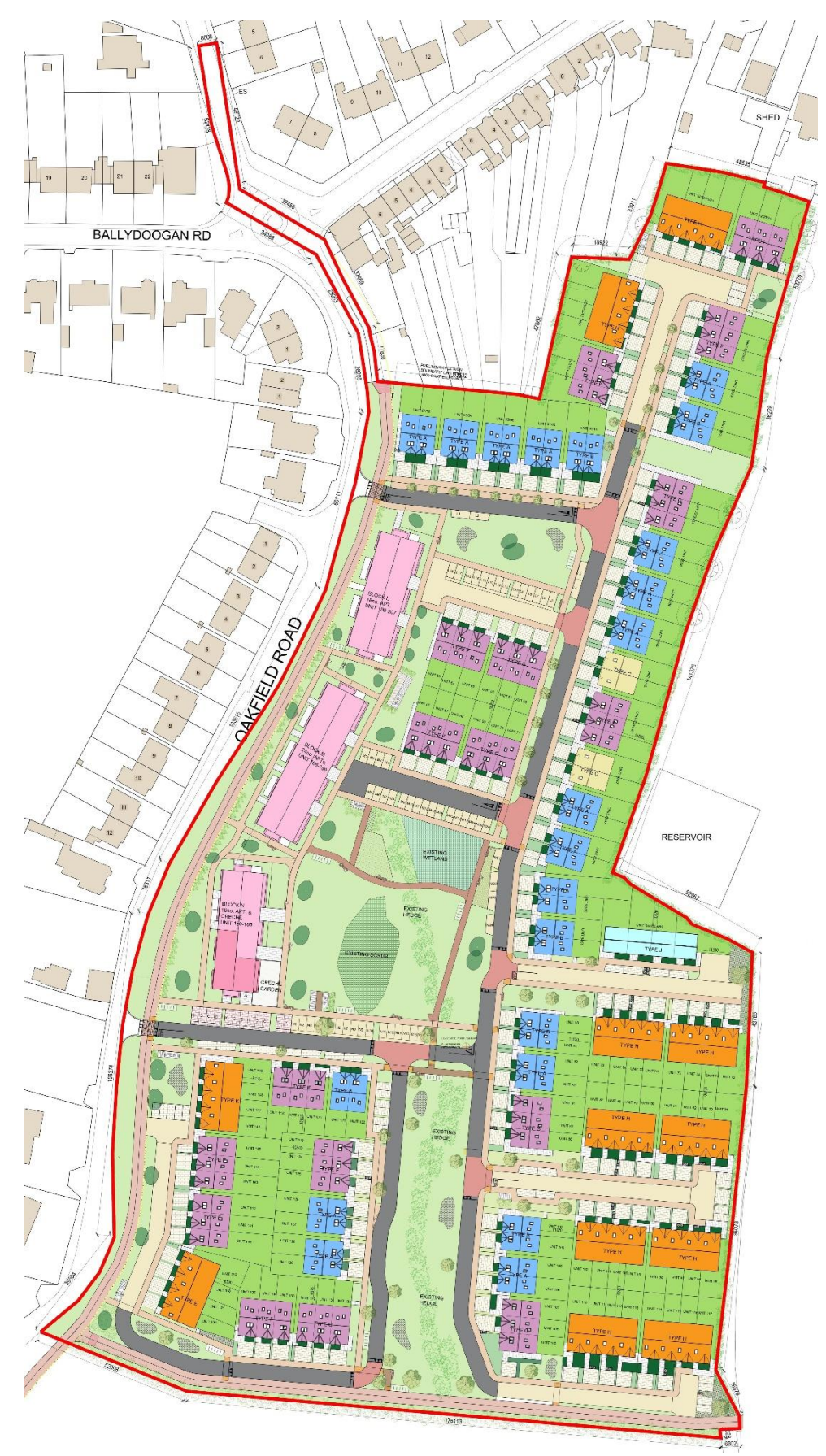
Figure 3 Proposed Oakfield LRD Scheme